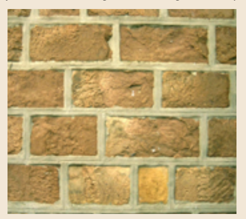
Fig. 8 Superficial over-pointing of stone with cement mortar.