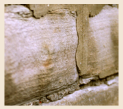
Fig. 6 Cement coating smeared on stone. The fine original joints can be seen where the superficial cement pointing has failed and detached causing considerable damage to the masonry.