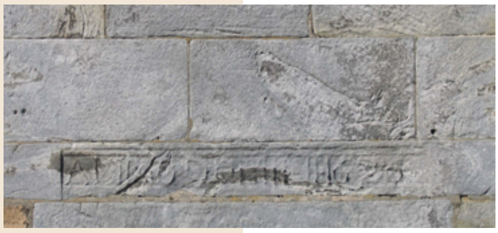
Fig. 1 Example of ashlar masonry with letters shown in relief.

Although well-established by this pedigree, it was only from the mid-19th century when stone quarrying and working techniques became more mechanised and economic that it became possible to build domestic dwellings that incorporated ashlar façades (Fig. 2). Found equally on city tenements, villas, and rural farmhouses, this approach to building lasted into the early decades of the 20th century.