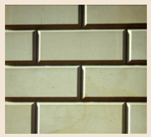
Fig. 4 Chamfered ashlar masonry.

The care and attention which was exercised during the original construction process needs to be recognised when repointing work is carried out to ashlar masonry. The precision required to repoint ashlar correctly demands a great deal of time and skill and should not be underestimated.