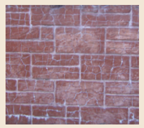
Fig. 7 Cement coating over ashlar showing crazed cracking over the surface.