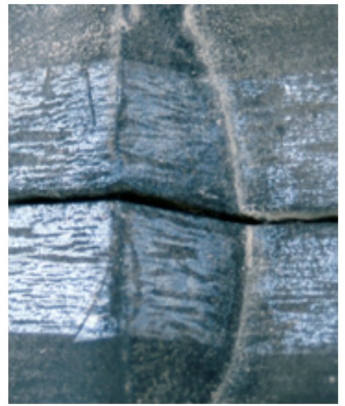
Fig. 11 Residue left on stone surface from sticky tape.