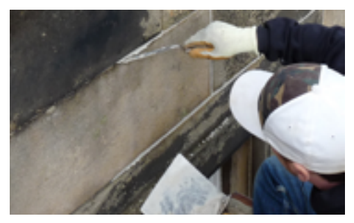
Fig. 12 Repointing ashlar using a fine pointing key.