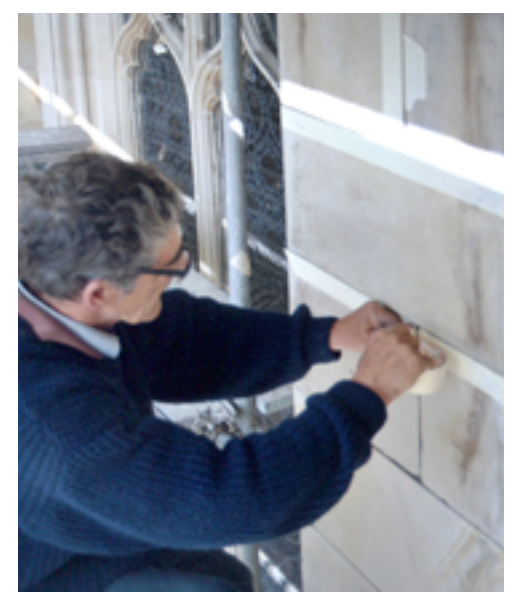
Fig. 10 Taping around joints to prevent staining and damage of stone.

Ashlar walling was frequently constructed with slightly tapered blocks to assist in achieving very fine joints on the face. As a result, the vertical joints, and sometimes the horizontal joints, may be considerably wider within the depth of the wall. If this is the case, it may be necessary to place a backing or plugging of waxed string or similar material, or a wedge of hair mixed with lime mortar, to prevent the new mortar from disappearing endlessly into the depth of the wall.