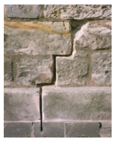
Fig. 9 Damage caused through the use of inappropriate power tools for removal of pointing mortar (© I. Maxwell).

material out by means of a handheld hacksaw blade inserted into the joint and gently pulled forward. It is generally not advisable to use power tools to cut out the decayed or loose mortar from the fine joints due to the risk of damage to the stone (Fig. 9), although, when used by a highly skilled operative good results can be achieved. Traditional hand tools such as chisels can equally cause damage as these simply do not provide the precision required for the fine joints in ashlar masonry.