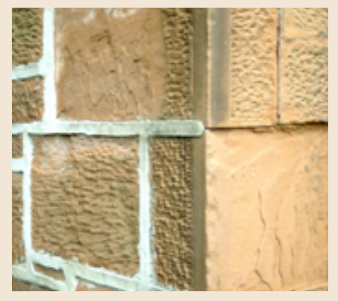
Fig. 5 Projecting cement pointing causing stone deterioration.

Care must be taken, and the appropriate tools used, in the preparation of ashlar for repointing if damage is to be avoided. Decayed mortar should be removed ('raked out') by carefully picking it out with a thin steel hook, or by easing the redundant