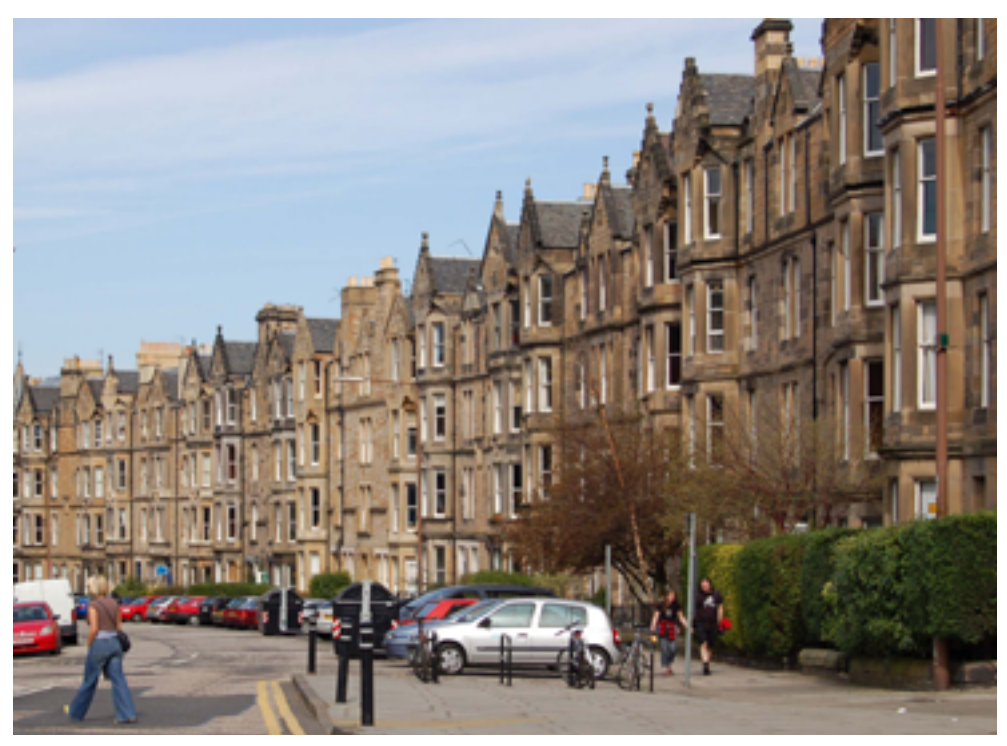
Fig. 2 Ashlar buildings became common in Scottish towns and cities during the 19th century.